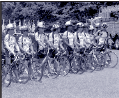
Bikers from the Brotherhood Ride