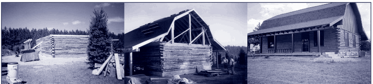
Three stages of construction of Barb & Jim Pelton's cabin: 1. walls; 2. roof; 3. finished!

Until the 4 th of July, Jim and I worked on it, doing what the two of us could do without help. On the 4 th , a group of friends who had helped from the beginning came to shingle the roof. Of course, it was one of the hottest weekends of the summer. They could only work a few hours in the