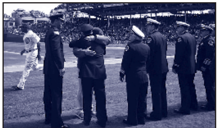
After team announcements