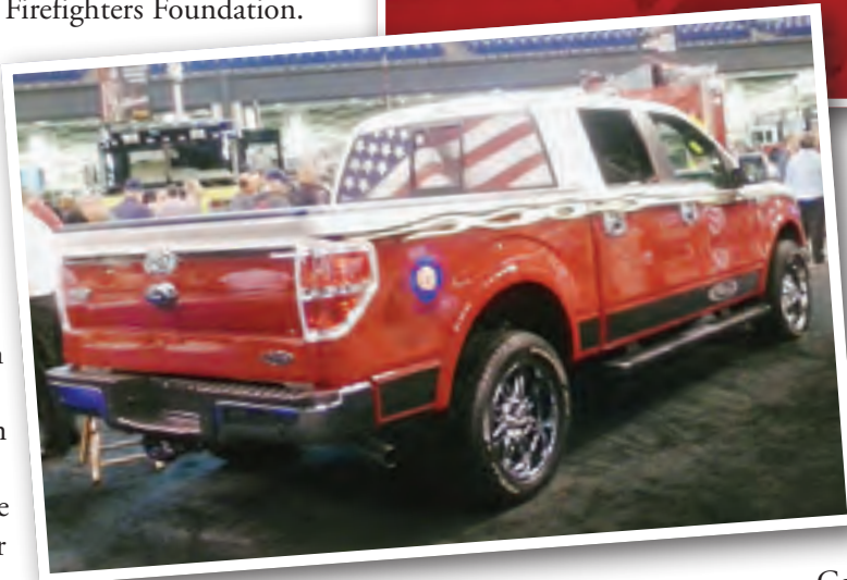
Pierce’s Ford F150 4 x 4 SuperCrew pickup

executive director. “With the help of partners like Pierce Manufacturing, their dealer network, the people of Oshkosh