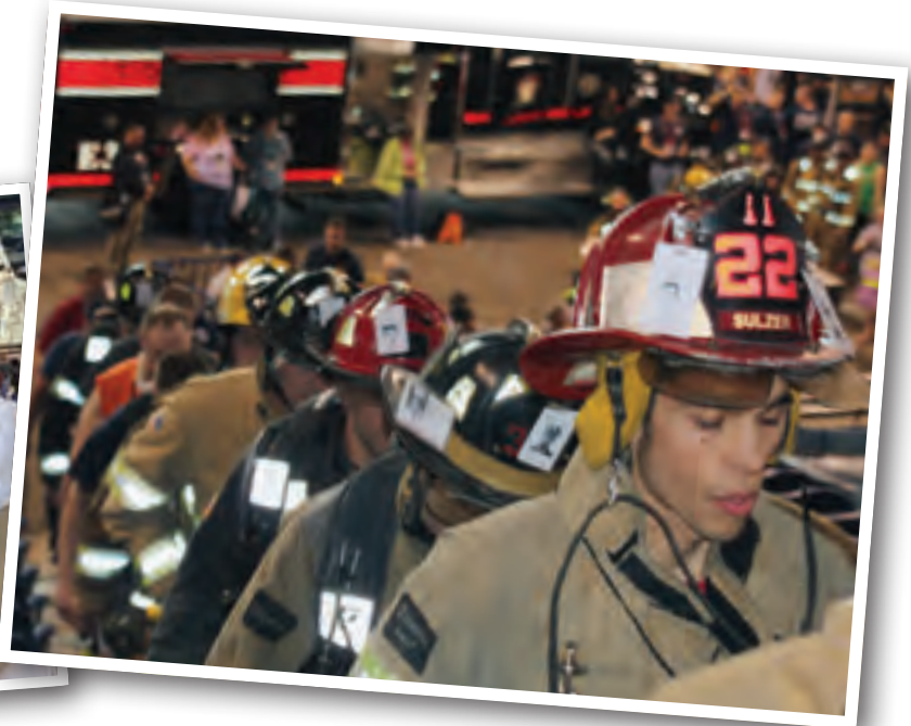
Stairclimb at Lucas Oil Stadium