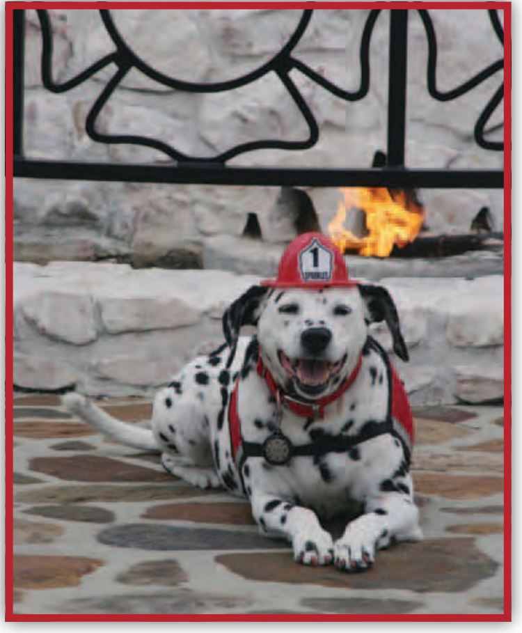
To learn more about Sparkles' pathway, or to donate a brick in this special section, visit: www.sparklesthefiresafetydog.com/sparklesmemorialpathway.html

Tango. These two Dalmatians are stepping up to the plate for Sparkles, and looking forward to helping support the work of the NFFF.