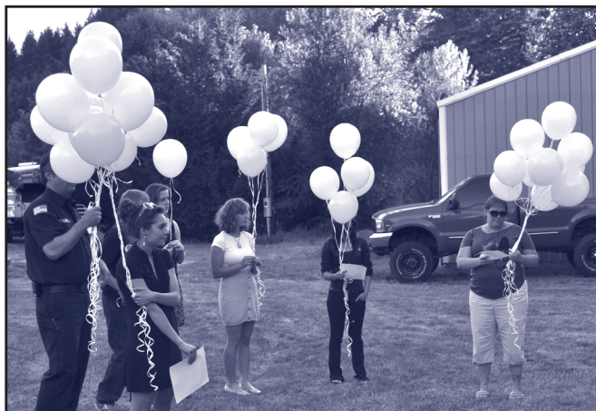
The memorial service held for Robert A. Hales by his family

friend gave me Roseanne Cash's Black Cadillac, and I have