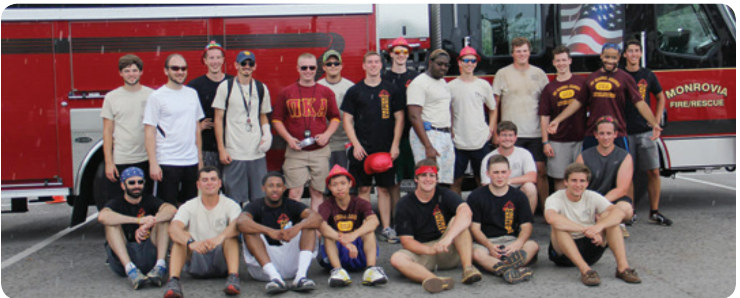
Theta Pi Chapter of the Pi Kappa Alpha fraternity at the University of Alabama in Huntsville

Thanks to the local sponsors, overwhelming attendance, and a lot of hard work, the Theta Pi Chapter of Pi Kappa Alpha was able to raise $6,000 in their first year. Out of that, they grossed $2,500 of proceeds for donation. The National Fallen Firefighters Foundation received 50% of the proceeds, amounting to $1,250. The remaining proceeds were split between the Monrovia Volunteer Fire Department and Madison Fire. The brothers of Pi Kappa Alpha hope to double this value in next year's Fireman's Challenge and can't wait to do it again. ■