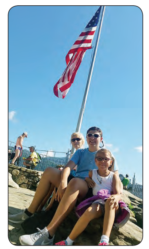
At the top of the mountain!

To make the fourth anniversary easier, my children, their families, and I traveled to Chimnev Rock for the weekend. We hiked up the mountain, logging in five miles. The serenity and beauty of the mountains helped us deal with this anniversary much easier. My faith in God has been the key in keeping me grounded. Friends and family can only do so much. At some