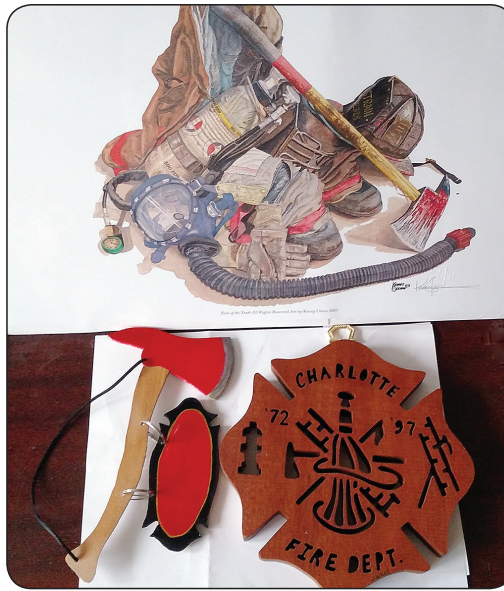
Items donated for the North Carolina family bags

The small gifts poured in from those I had approached—from bottles of soda to crafts to household and comfort items. The bag was filled, and now we are receiving so many gifts we have expanded the bags from 2 to 3 per family. After the memorial service, I make sure to send thank you notes to all who have participated in donating items for the honored family. And I look forward to them sharing with me again next year.